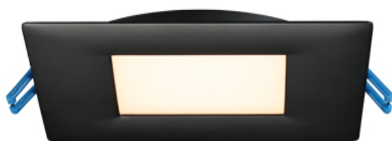
Type IC, Wet & Air-Tight